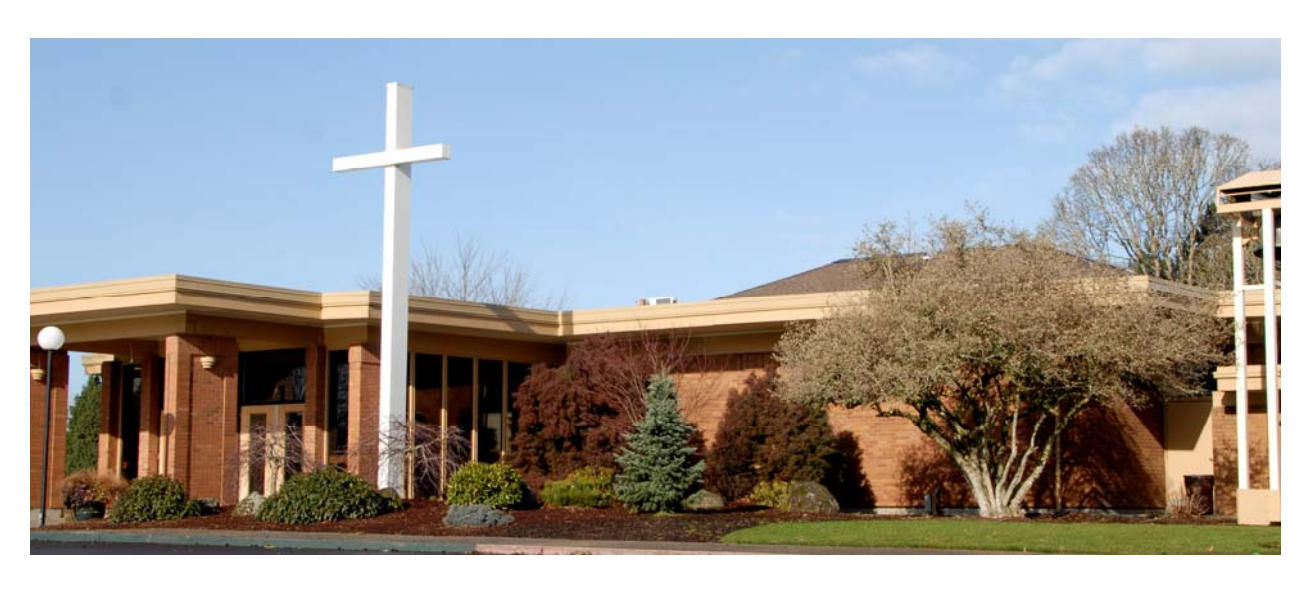
St. Edward Church — January 2008