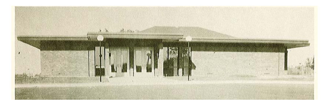
St. Edward Church — November 1967